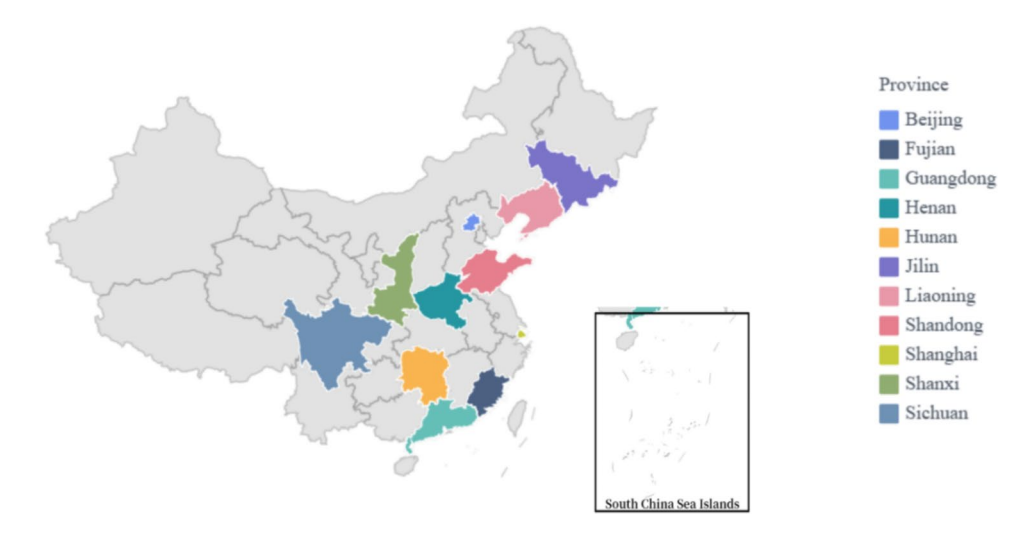
Fig. 1 Geographical distribution of the participants

text version formed after each coding session was spoken back to the interviewees for authenticity review. In terms of originality, based on the interview outline and the onion model, the content and hierarchy of NCC are explored, and relevant theoretical models are developed to extend the existing content. Finally, in terms of utility, qualitative data analysis allows for the expansion of new conceptual categories to improve and complement